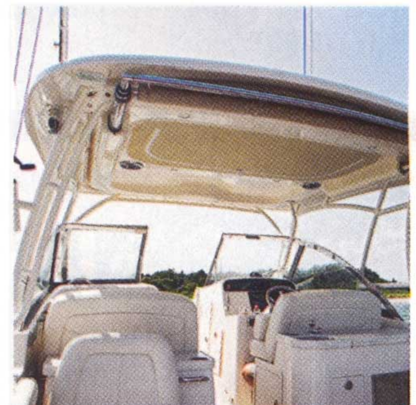
↑ The Grady-White hardtop is shown here equipped with an electrically deployed cockpit awning.

and it carries plenty of water to rinse the gear on the ride to port, so nobody's left cleaning up when the crew cracks the celebratory refreshments.